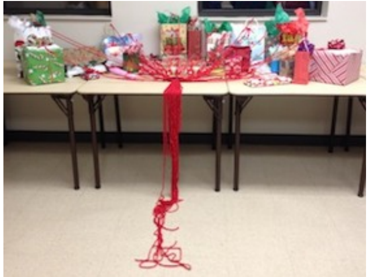
Twenty eight wrapped packages were exchanged at the Christmas party. All but one contained a gift. Questions? Ask Jack.