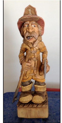
Fireman by PJ Driscoll

Cost: The cost of the class is $150, which includes the class selected rough-out. The non-refundable reservation fee for the class is $20, due by May 1 st . The remaining $130 is due at the time of the class. Additional rough outs are extra.