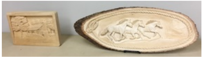
More show and tell for April

The EOWA is a proud member of the Oklahoma Arts Council and the Arts and Humanities Council of Tulsa.